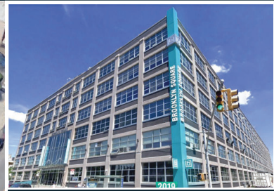
ACCESS SHOPS RESTAURANTS AND OFFICES AT BROOKLYN SQUARE!