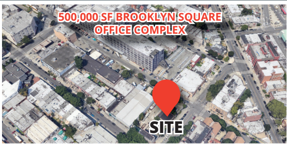
500,000 SF BROOKLYN SQUARE OFFICE COMPLEX